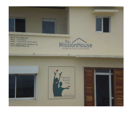
TMHM Office & STAFF