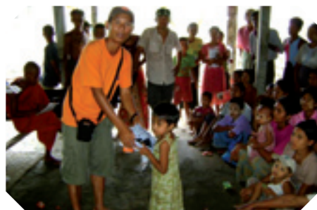
Relief for little children