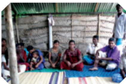
Discussing development needs with displaced war refugees