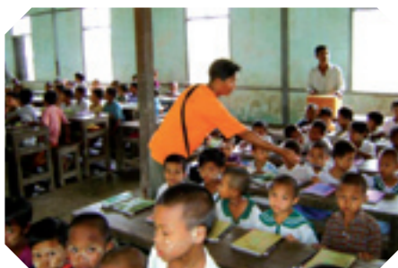
Relief - school supplies