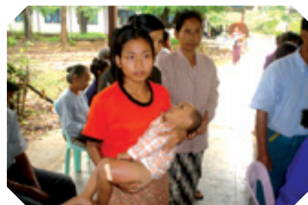
God save this little one