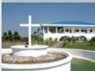
Hope Orphanage accommodation block