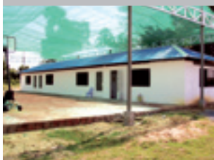
Hope Orphanage School block