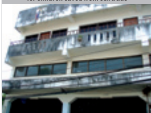
Rescue centre (near Burmese border) for children saved from sex trade

Provision of recycled computers for rehabilitated ex-offenders, prostitutes and drug addicts being re-established in society.