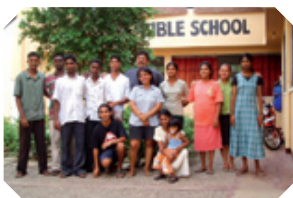
Missionaries at training school - Kandana