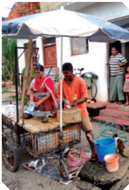
Micro finance success story - fish vendor