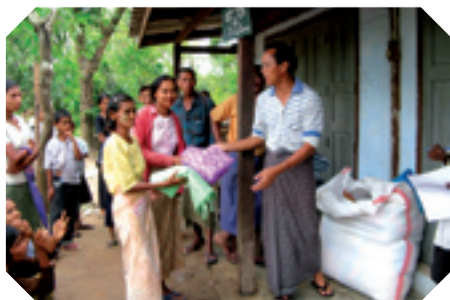
Giving out blankets and mosquito nets