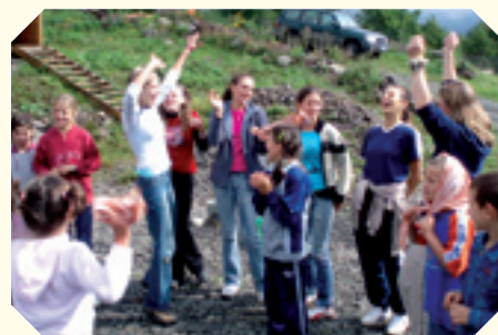
a lighter moment at Colibitsa (Transylvania mountains)