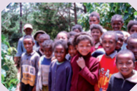
Some of the children at Le Triomphe