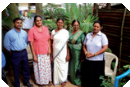
Oversight committee of micro finance project in Colombo slum