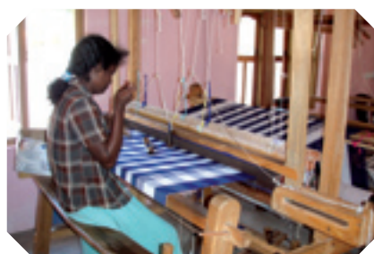
Tsunami widow weaving cloth at micro enterprise unit