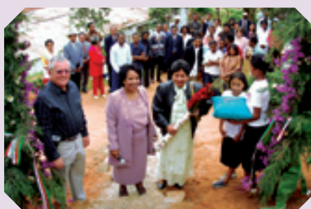
After the tape cutting: NK, Madame Eliezera (Le T Principal) and Govt. Minister