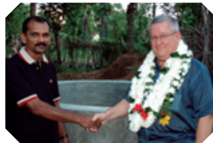
NK receives thanks from village leader for provision of well