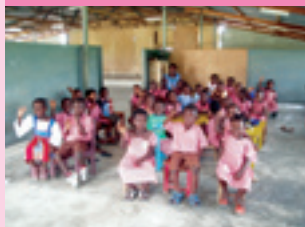
Kutunse - Junior Class