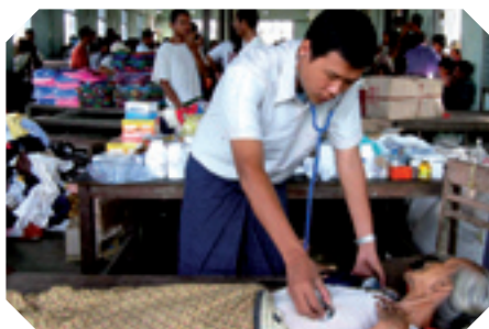
Relief - medical care