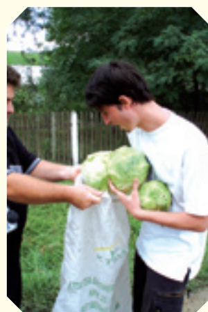
Preparing food relief for distribution

■ Summer 2008 Community Development for local and Roma (Gypsy) people.