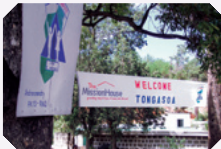
Water Project commissioning in December 2006