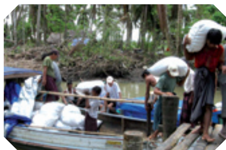
Reaching victims with rice

In the midst of all the difficulties God is doing a great thing in Myanmar (Burma). Local Christians are currently at the forefront of aid and relief efforts having found unprecedented favours with the authorities. Churches have formed a coalition to work together for cyclone relief. One of their strategies is to build a community centre in each town from which to coordinate the rebuilding efforts. God is up to something which is slowly unfolding in the midst of this tragedy. Christian leaders in Myanmar have been praying for transformation for years, and they see the present situation as the beginning of God's answer to their prayers.