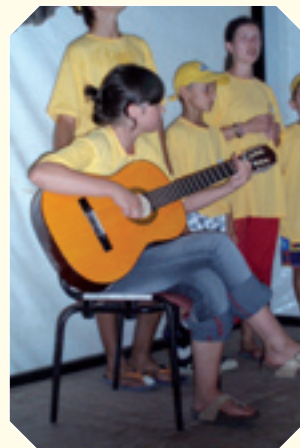
Their turn to lead daily worship