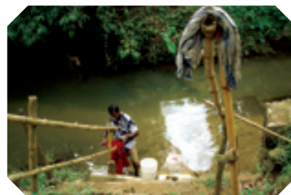
The only way to access to this rehab unit is to wade the river