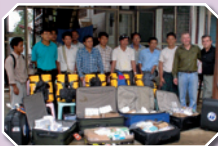
Relief supplies and relief team