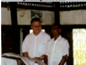
NK addresses (through interpreter) graduating nurses aides