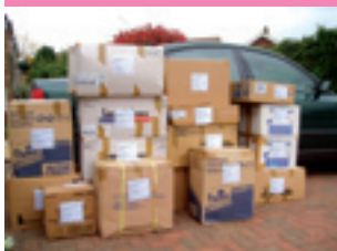
School Supplies about to be dispatched