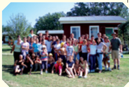
Campers and staff, Taut 2007