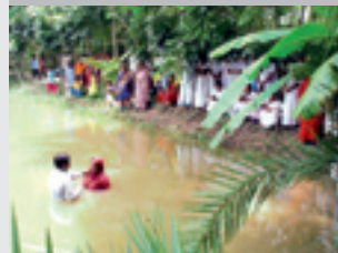
Baptism service in progress