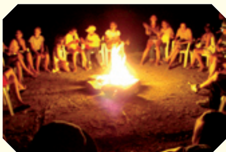
Camp fire at Taut (current venue)