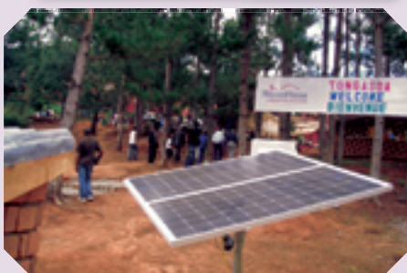
Solar Cell power source for pump