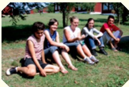
Discussing life issues