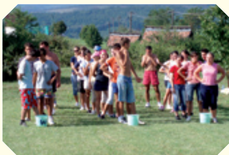
Waiting for the 'off'