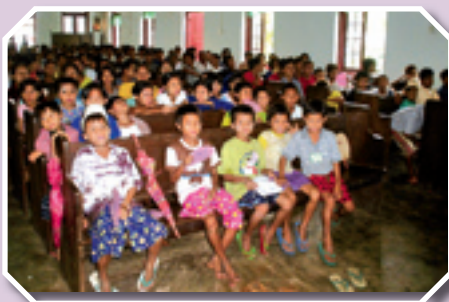
Refugees of cyclone