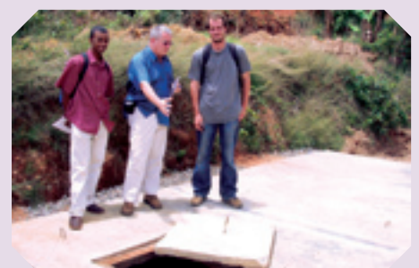
NK and contractors 'discussing' amendments to tank