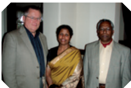
NK meets with Principals of Paynter childrens home